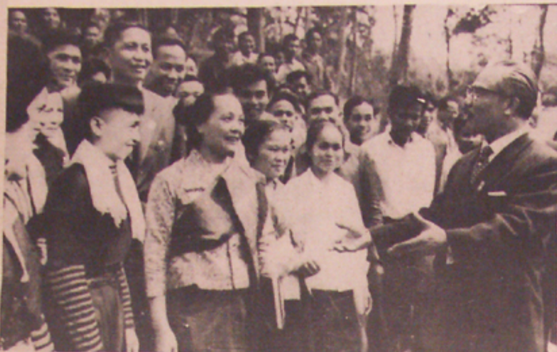
Prince Souphanouvong with tribal representatives during the 2nd Congress of the Neo Lao Haksat

The U.S. has used the territory of Thailand, a "second Okinawa" of the U.S. in Southeast Asia - as a huge base, a springboard for intervention and aggression in service of its "special war" in Laos. Since May 1964, Thailand has become a staging area for U.S. bombings on Laos. The whole network of U.S. air bases in Thailand, including the Utapao strategic airbase are serving the present air strikes. The U.S. air forces in Thailand are taking charge of almost all the air strikes in Laos. For their part, the Thai reactionary ruling circles, doing their best to help the U.S. imperialist aggressors and in close collusion with the henchmen of the U.S. in Laos while pursuing their own ambitions against Laos, have become an accomplice of the U.S. imperialists in the sabotage of the 1962 Geneva Agreement on Laos.