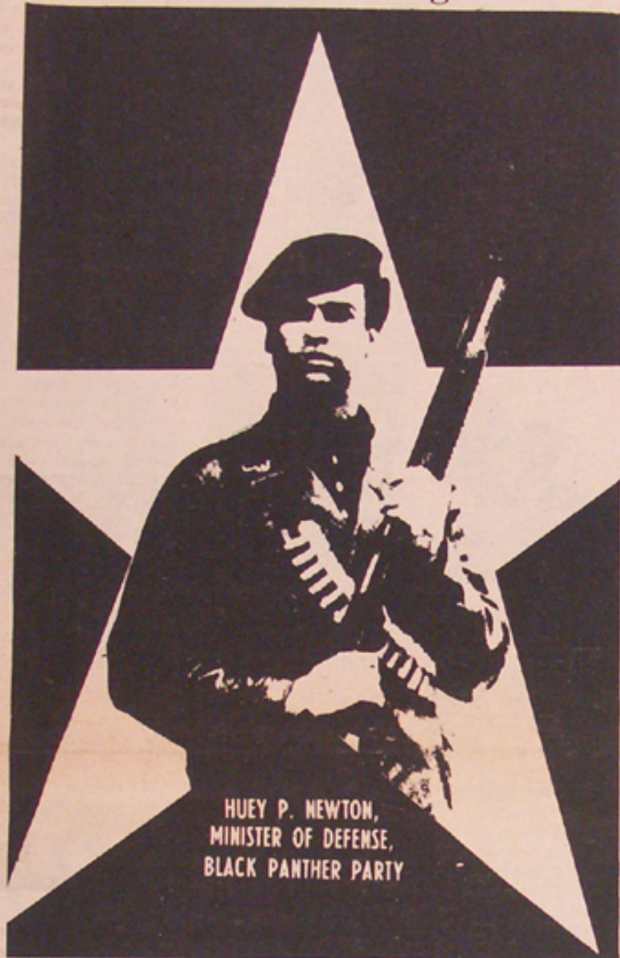
HUEY P. NEWTON, MINISTER OF DEFENSE, BLACK PANTHER PARTY