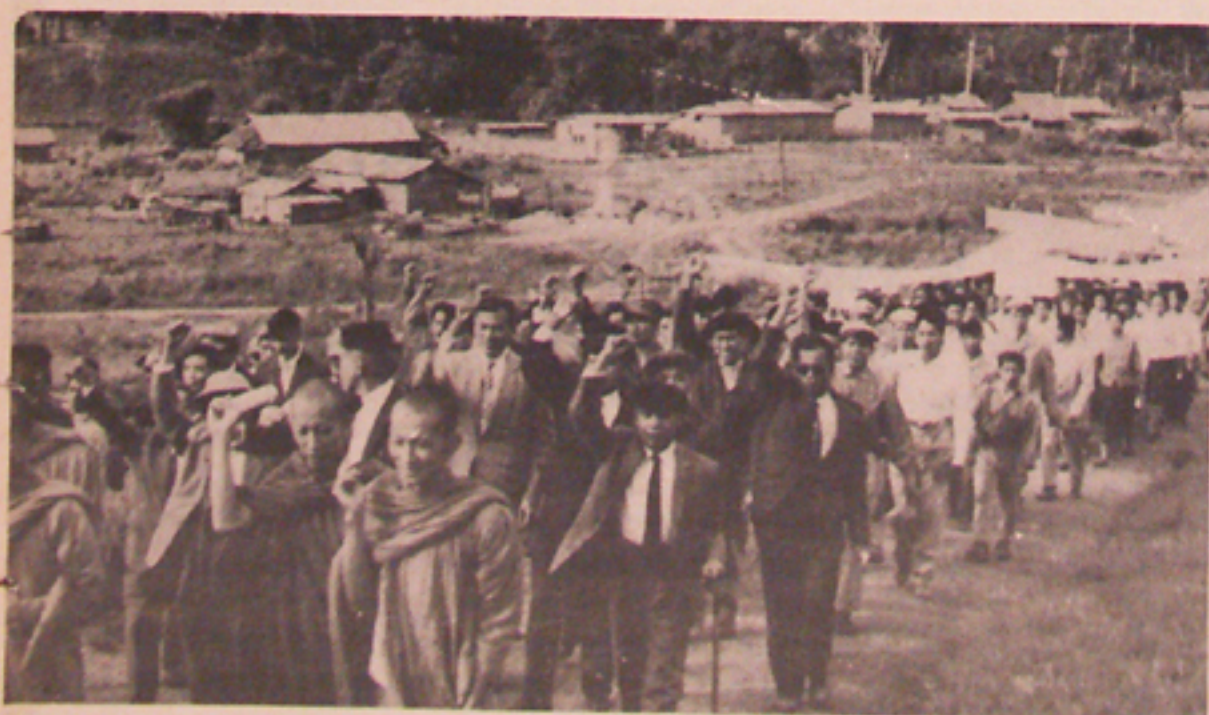
Demonstration against the U.S. imperialist aggressor and their lackeys for bombing the liberated zone.

ALL POWER TO THE PEOPLE Southern California Chapter