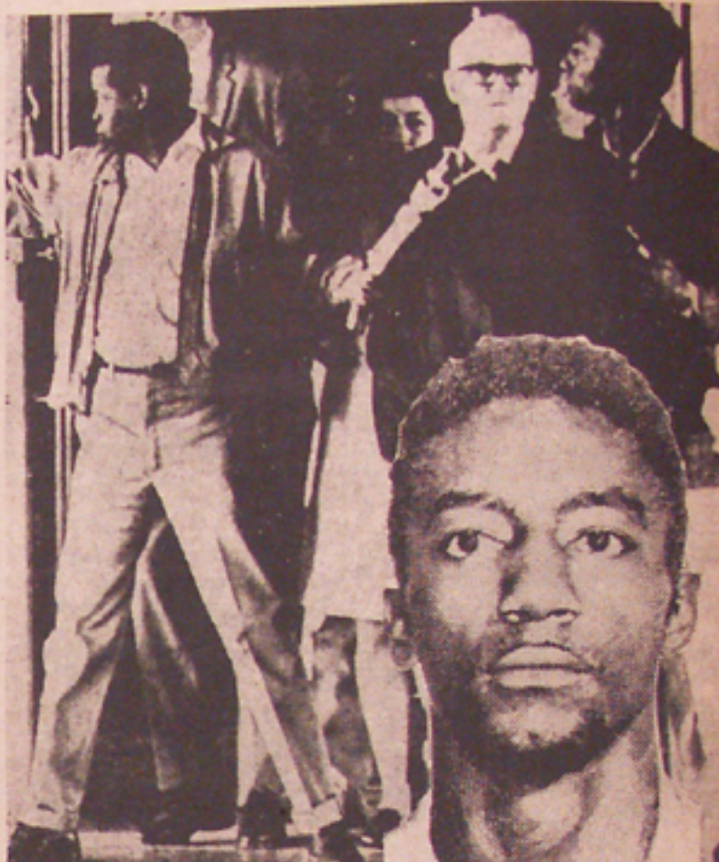
RUCHELL MAGEE — POLITICAL PRISONER OF SAN QUENTIN PRISON

Anyone with an ounce of brain favors life to death. Can any