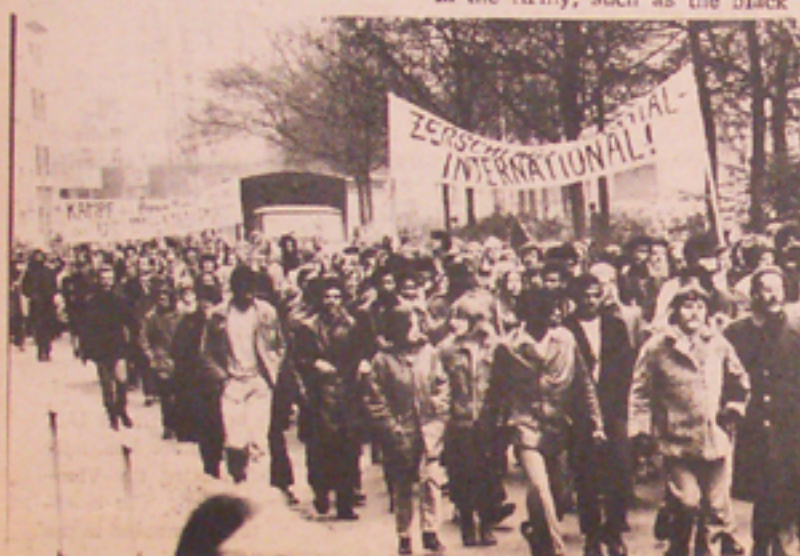
BLACK G.I.'S PARTICIPATING IN DEMONSTRATION IN FRANKFURT, GERMANY.

Death To U.S. Imperialism! Long Live The Minister of Defense!