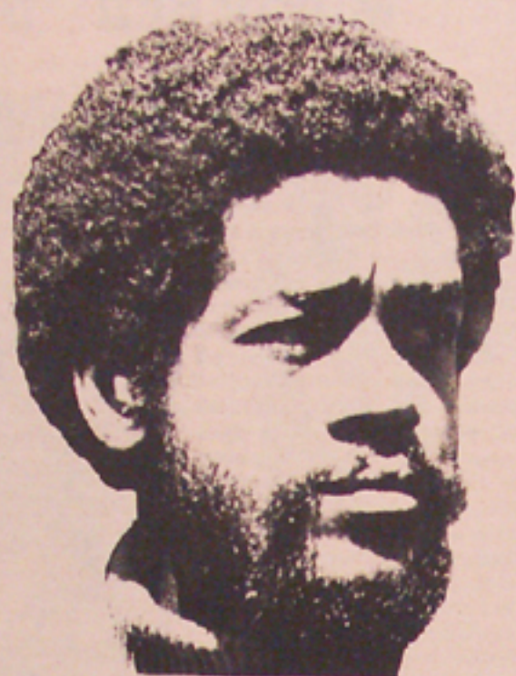
BOBBY SEALE CHAIRMAN OF THE BLACK PANTHER PARTY Political Prisoner