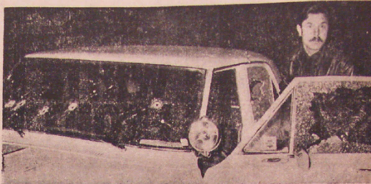
Patrol car that pig was riding in.

The racist dog policemen must withdraw from our communities immediately, or suffer the wrath of the armed people as pig Lawrence Heap did.