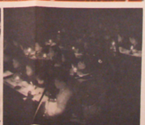
An elementary education school class being held in a cave.

The PRG (Provisional Revolutionary Government) in Paris has today issued an appeal to the students and youth conference in Ann Arbor, Michigan and to peace loving people throughout the world to initiate firm, broad and immediate action including massive street demonstrations to condemn U.S. aggression in Laos and to check new plans to invade Cambodia, Laos, and North Vietnam. The PRG confirms that as of February 4, 1971 tens of thousands of Saigon, Thai and American troops have crossed into Laos with motorized vehicles. More than 20,000 Saigon paratroopers, Marines and rangers are involved. At least two regiments of the 3rd infantry division of the puppet Thai army have gone into Laos, in coordination with the puppet army of Laos. The PRG asserts that U.S. ground troops, and not just American advisors are involved and that round the clock bombing to support the ground troops is being carried out by the U.S. Air Force in Laos. This military aggression is the first stage of a still larger aggression being planned. The PRG says that the apparent U.S. plan is to invade all of Indo-China, including Laos, Cambodia and North Vietnam and that 10,000 U.S. troops are now massed on the Laotian border.