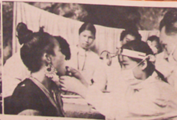
A hospital in the liberated zone.