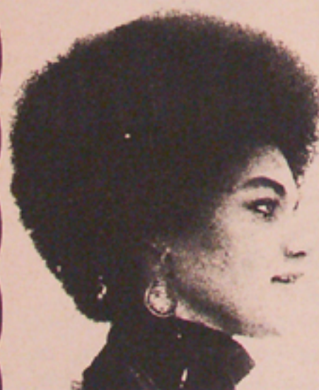
SPEAKERS: Huey P. Newton Kathleen Cleaver

FRIDAY, MARCH 5TH, 1971 7:00 PM to 11:00 PM OAKLAND AUDITORIUM ARENA 10 - TENTH STREET OAKLAND, CALIFORNIA