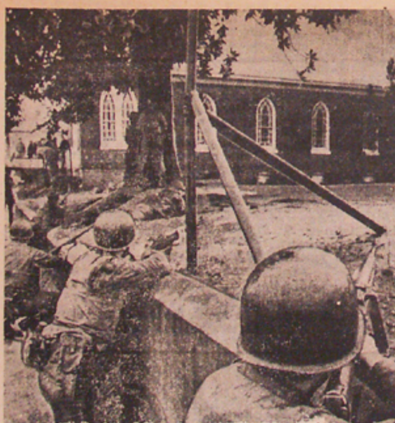
Gregory Congregational Church, N.C.

As the fascist armed forces of the American empire invade new territory and step up their aggression in the communities of Southeast Asia, so do they increase their oppression of people inside the U.S. community. In recent weeks the Afro-American, Mexican-American and Asian-American peoples have experienced escalated attacks. Black High school students in Wilmington, North Carolina are currently boycotting their schools in demand for changes in the educational institution.