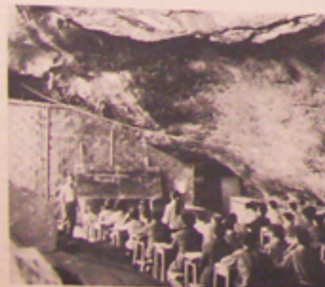
The Central School for Teachers in a cave.