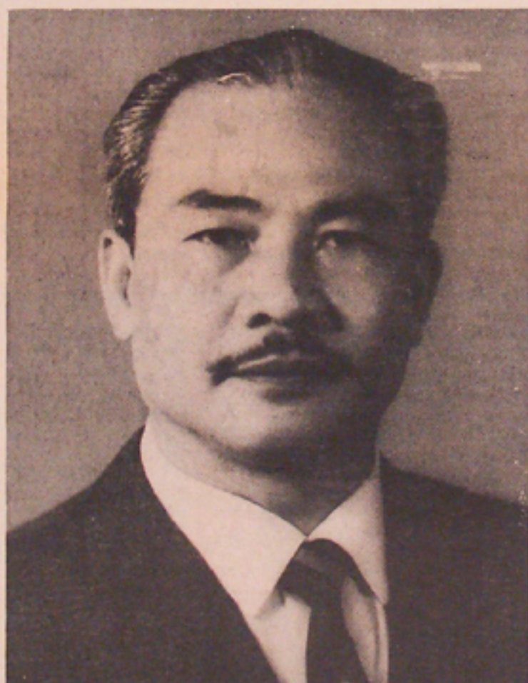
Prince Souphanouvong, Chairman of the Lao National Patriotic Front (Pathet Lao)

areas controlled by the lackeys of the U.S. in an attempt to suppress the Lao people's patriotic movement. Since then, the "special war" in Laos, a neo-colonialist war of aggression undertaken by the U.S. imperialists ever since the signing of the 1954 Geneva Agreement on Indochina, has been broadened with each passing day.