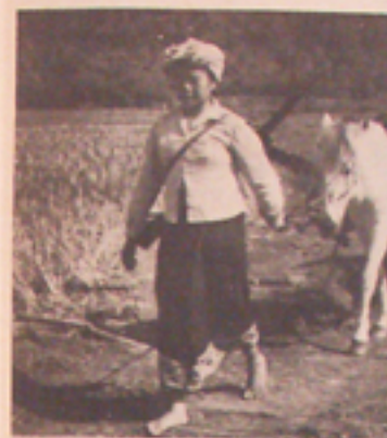
Laotian woman taking supplies to the Front

MADAME NGUYEN THI BINH, FOREIGN MINISTER OF THE PROVISIONAL REVOLUTIONARY GOVERNMENT OF SOUTH VIETNAM