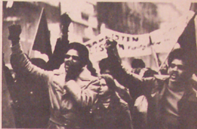
G.I.'S EXHIBITING THEIR SOLIDARITY WITH THE BLACK PANTHER PARTY.

Due to the limited amount of time Kathleen had to spend in West Germany, we had to organize a publicizing campaign to inform as many brothers and sisters as we possibly could that she was coming to Frankfurt on Thanksgiving Day, to really give them something to be thankful for.... CORRECT INFORMATION. We had to distribute this material (posters, leaflets etc.) all over West Germany by way of car, and we only had access to two automobiles, so we divided the distance